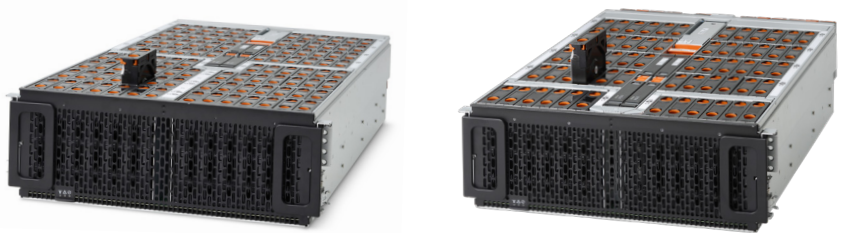
Ultrastar Data102 and Ultrastar Data60 Storage Platforms

Prior to implementing the new solution, ACC used so-called departmental file servers that frequently hit capacity limitations and were difficult to keep synchronized. After the implementation, they had up to 1.2PB of centralized storage with the potential to grow to multiple petabytes going forward. Data could be shared among multiple workstations. The mirrored servers running Open-E JovianDSS in tandem provided uninterrupted service to meet the 24x7 access requirement.