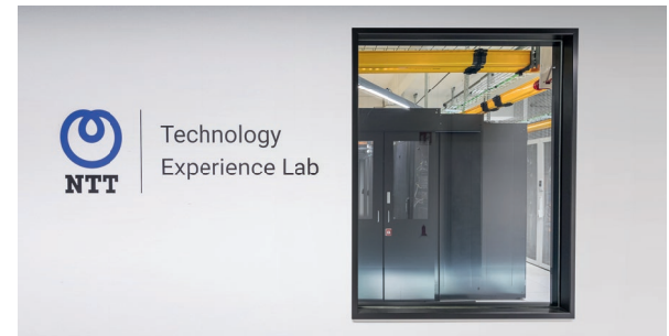
Technology Experience Lab in Frankfurt