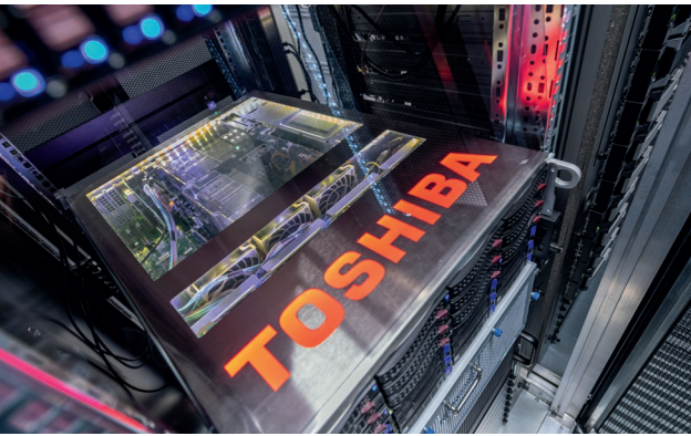
Server and Storage in the Technology Experience Lab